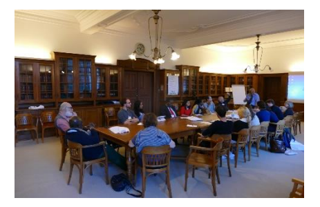
Participants during lecture and workshops at the symposia.