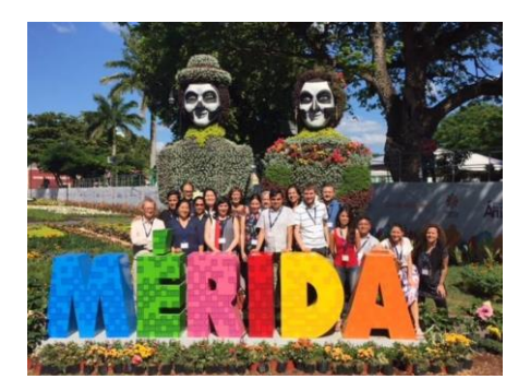
Participants in Mérida

15 collaborators from Africa also came together in Beira, Mozambique November 14-16<sup>th</sup> for a similar idea. They aimed to stimulate the collaboration and communication between partners, including universities, research institutions, students and alumni and to develop new project that can be carried out together.